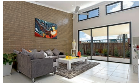
Economix Indicator results for the Satori 9 Star home.